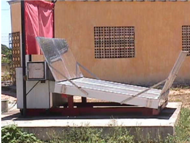
Picture 1. Photo of the solar cooker tested in Fortaleza - outdoors model with heat storage tank and oven.

The system shown in Figure 1 is installed in Fortaleza and its basis characteristics are: high quality flat plate collectors (4m 2 ); one storage tank (50 L); one cooking unit with 3 pots and 1 oven; 5 control valves.