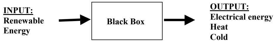
Figure 1: System as black box

The system theoretical approach was chosen in form of a black box ( Figure 1 ). In the example of residential buildings presented here any renewable energy form is admitted as input and the energy forms electric power, heat and cold as output.